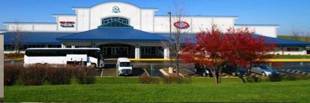
Fox Valley Ice Arena