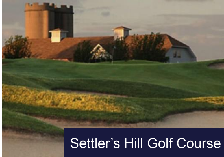
Settler's Hill Golf Course