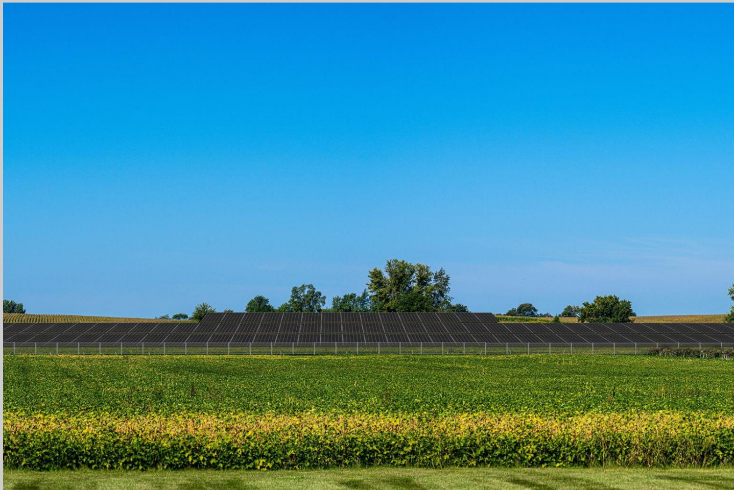
Artist rendering of solar facility as seen from 1N700 Meredith Road