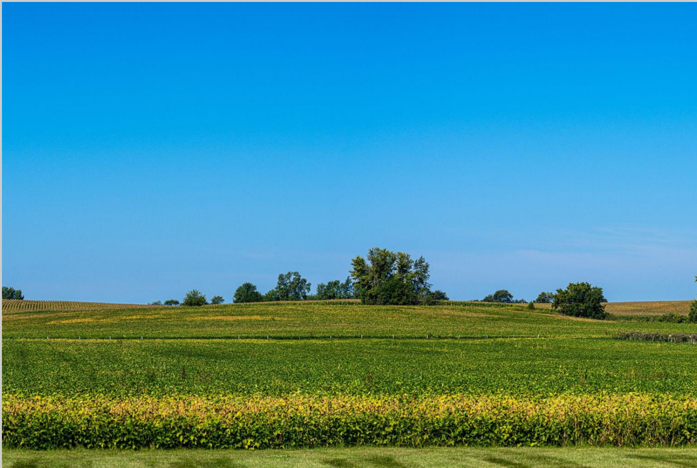
View west from 1N700 Meredith Road